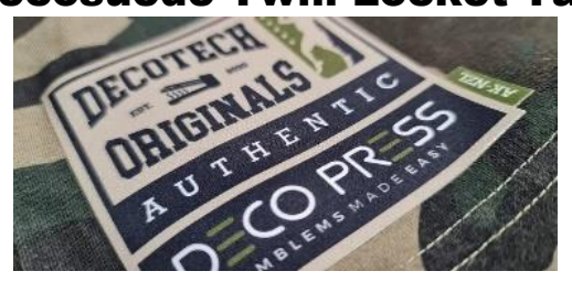
Decosuede Twill Locket Tag