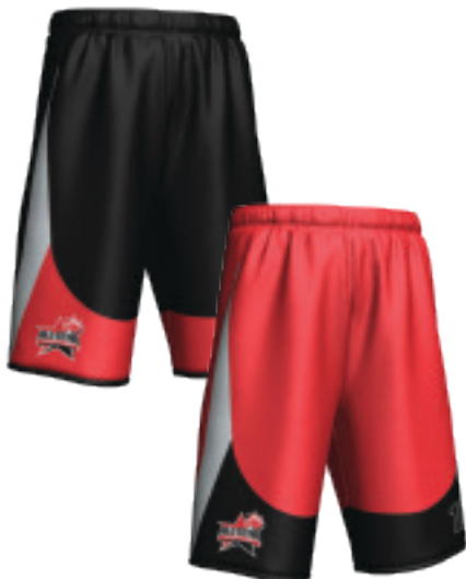
Adults Reversible Shorts, Side 1 - Top, Side 2 - Bottom pictured