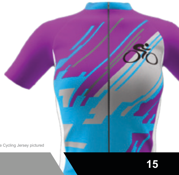
Ladies Short Sleeve Cycling Jersey pictured