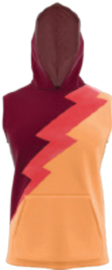
Adults Training Sleeveless Hoodie pictured