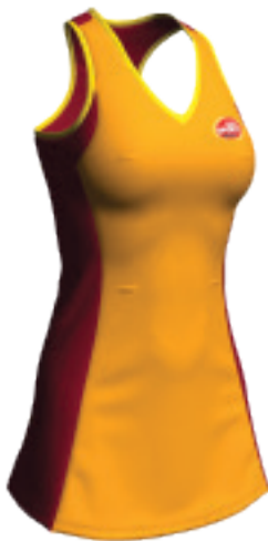
Ladies Elite A-Line Dress pictured