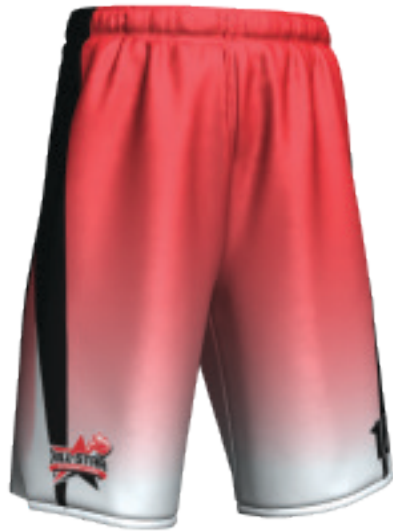
Mens Elite Shorts pictured