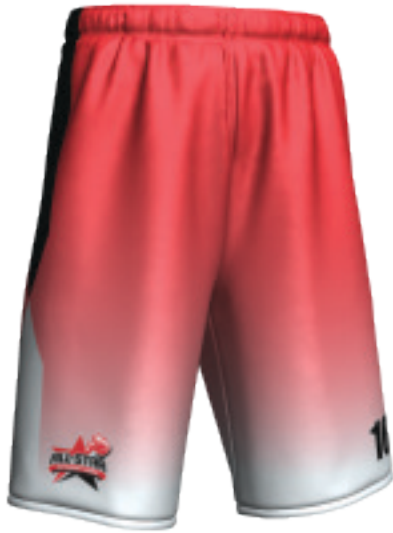
Mens Standard Shorts pictured