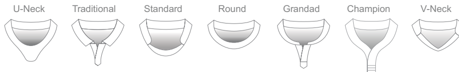
Available Collars (7):