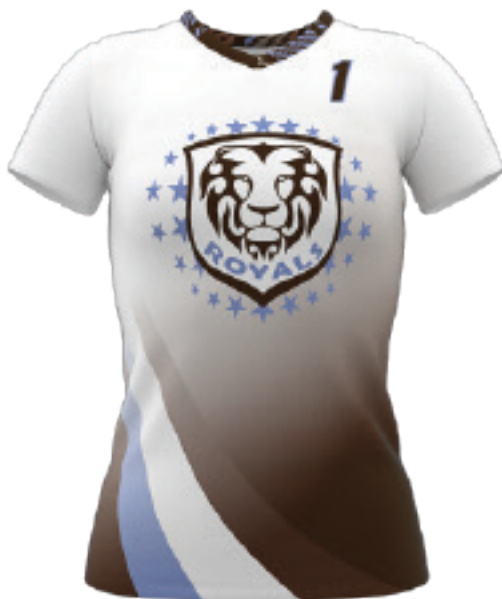
Ladies Playing Top pictured