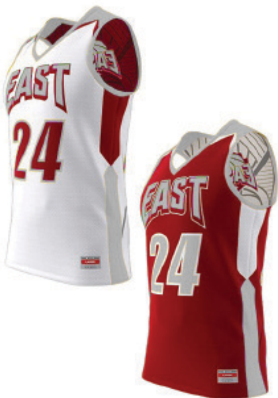
Mens Slam Dunk Singlet pictured