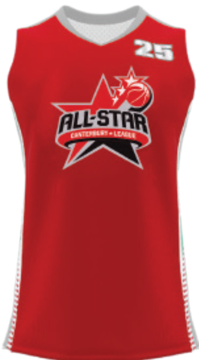
Mens Standard Singlet pictured