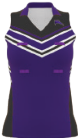
Ladies Sleeveless Top pictured