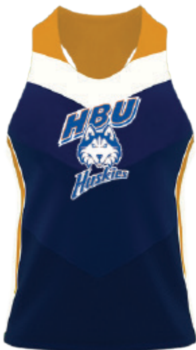
Ladies Standard Track Singlet pictured