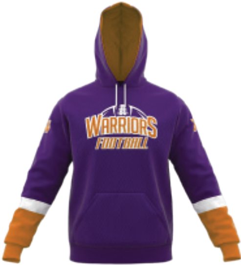
Adults Pullover Hoodie pictured