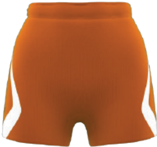
Adults Playing Shorts pictured