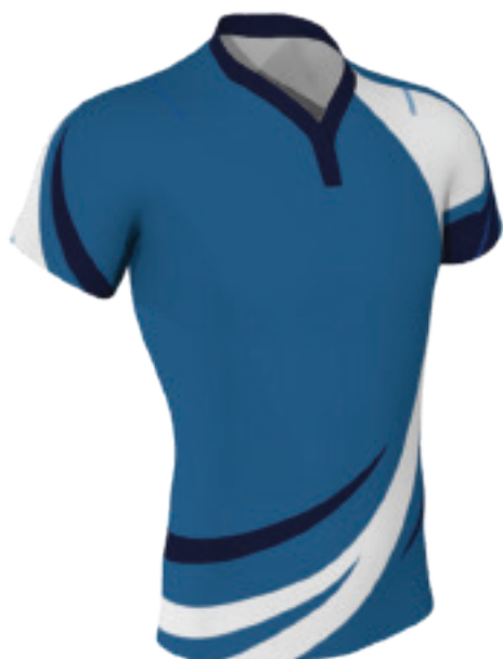
Mens Standard Fit - Standard Collar pictured