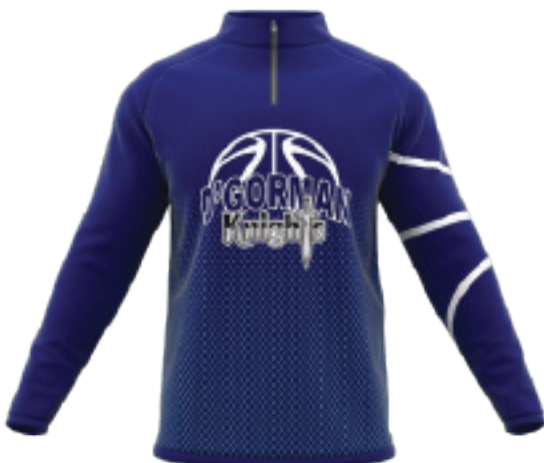
Adults Qtr. Zip Pullover pictured