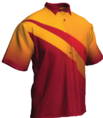
Adults Qtr. Zip Hybrid pictured