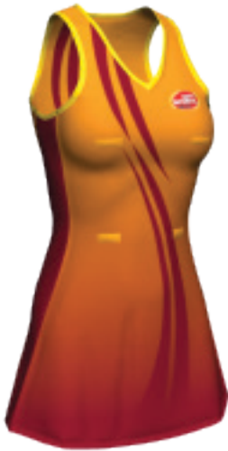
Ladies Standard Dress pictured